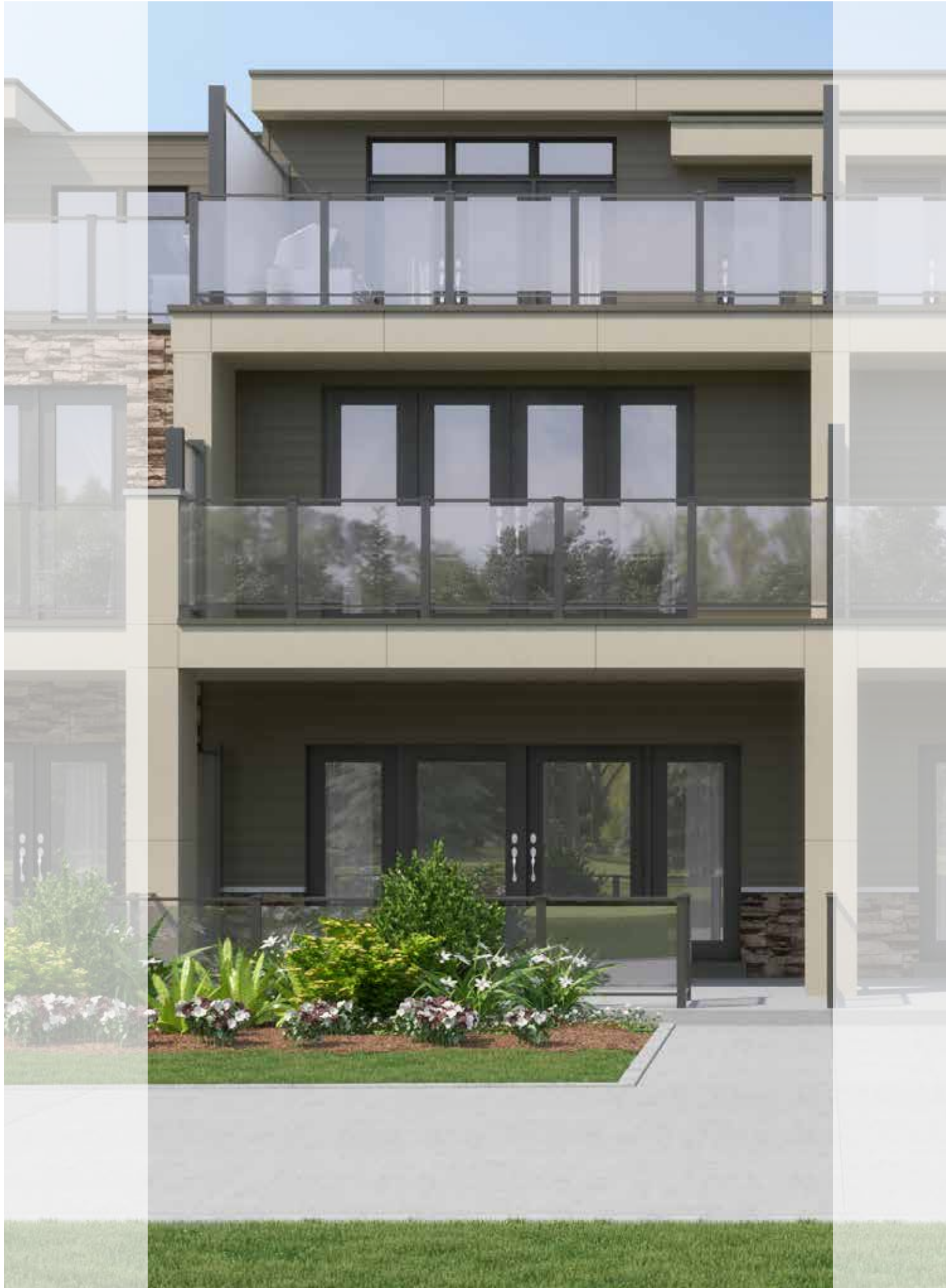
ELEVATION A FRONT 2,006 SQ.FT. INCLUDES 85 SQ.FT. O.T.B.